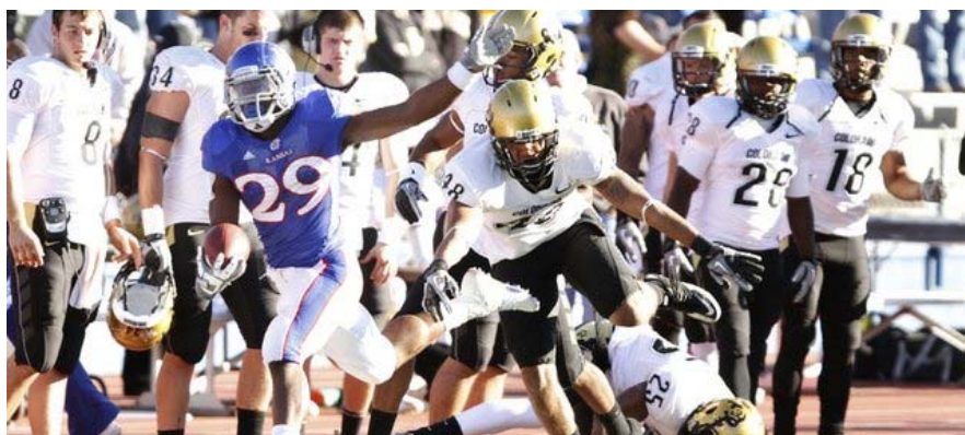
Enlarge photo.